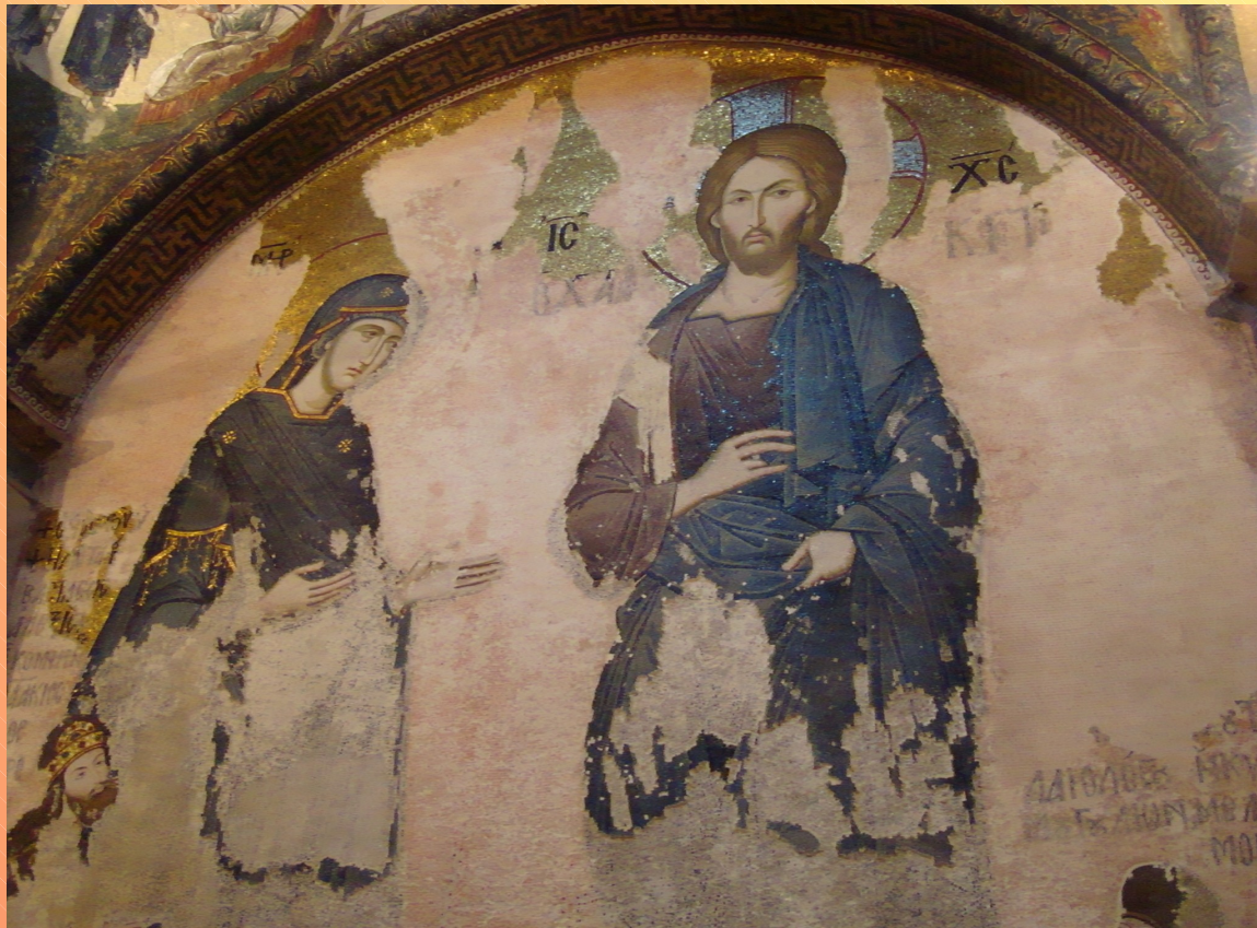
Hora Monastery afresco, Konstantinopolis

Easter is the most important ceremony in Greece, affecting believers and not-believers. The magical atmosphere with the candlelit churches, the scent of flowers and the Byzantine chants fills everybody with a spiritual feeling of being part of something special.